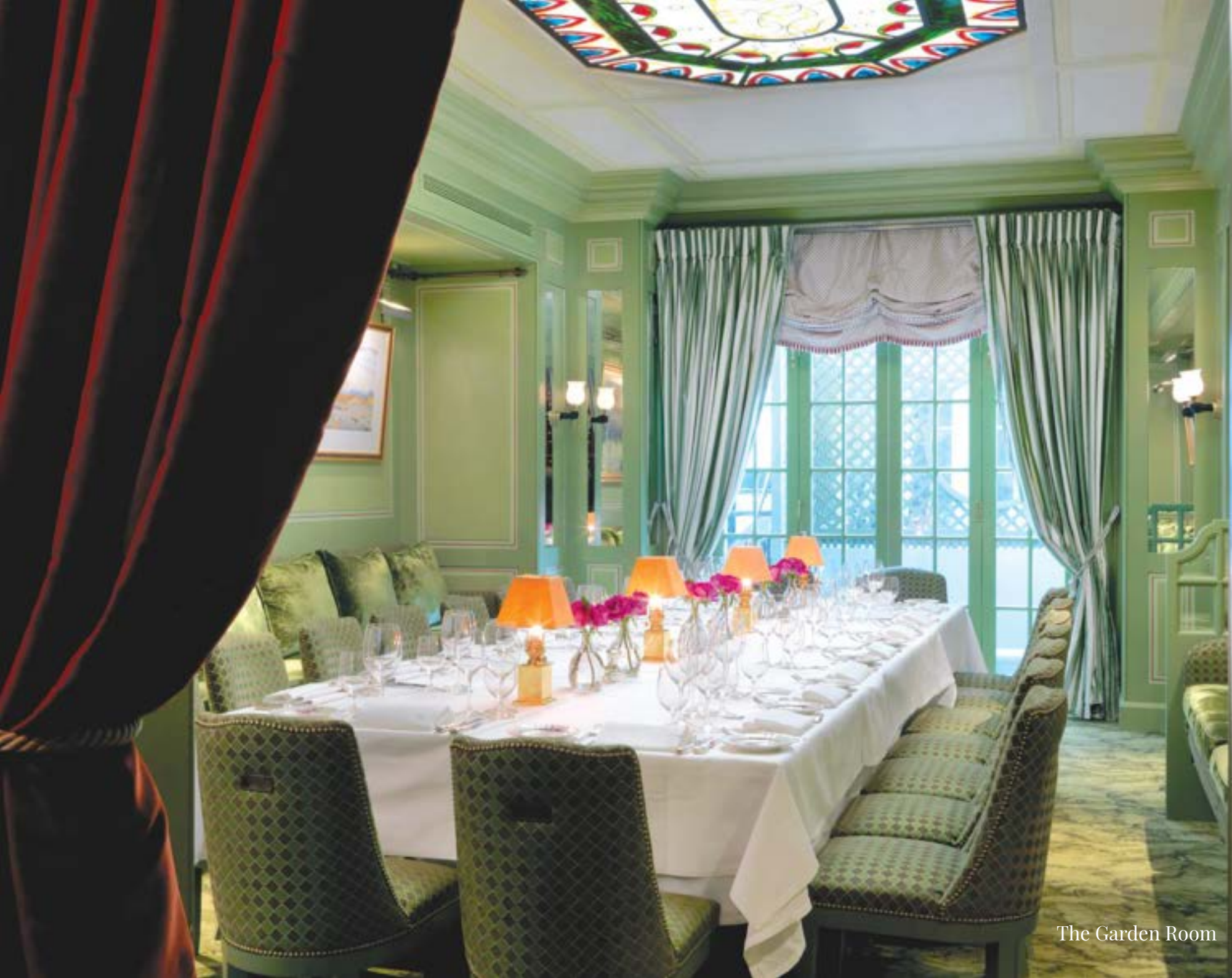
The Garden Room