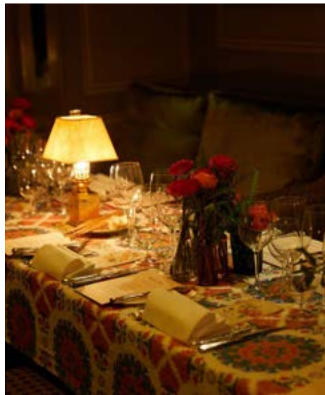
The Garden Room