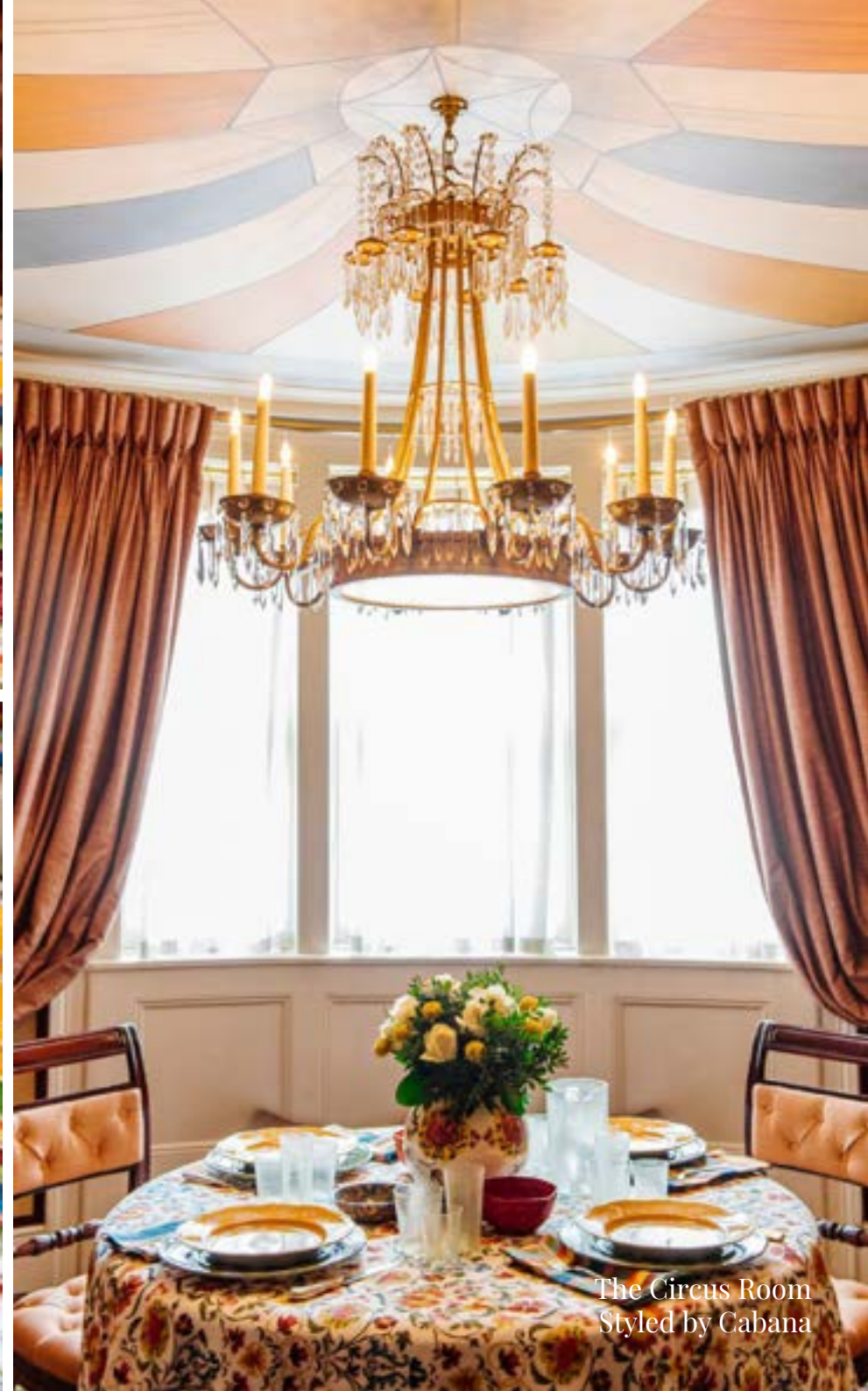
The Circus Room Styled by Cabana